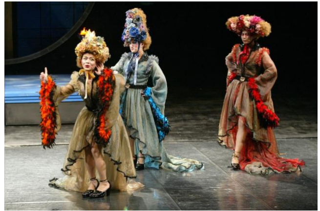
The Magic Flute: A New Musical (2003) Taipei Philharmonic Theatre As Actor