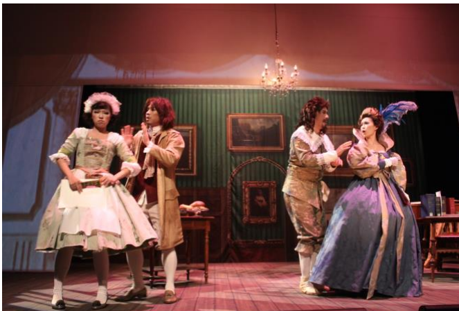
Prima la Musica, Poi la Parole (2010) National Performing Arts Center Opera Studio As Assistant Director