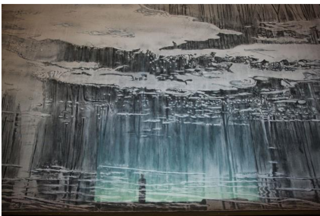
Orlando (2009) directed by Robert Wilson Taiwan International Festival of the Arts As Associate Producer