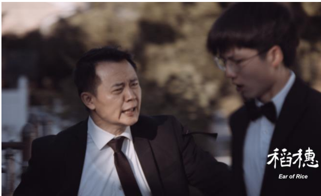
Ear of Rice (2022) Short Film Actor