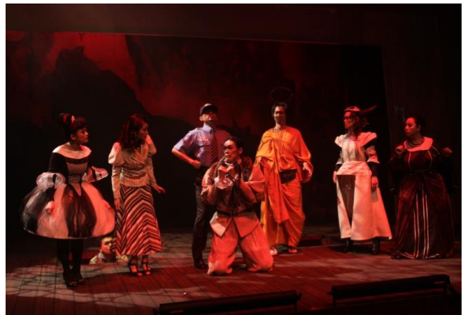
Too Many Sopranos (2010) National Performing Arts Center Opera Studio As Assistant Director