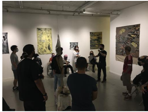
Cultural Workshop: Visual Arts (2021) Chinese American Arts Council As Facilitator