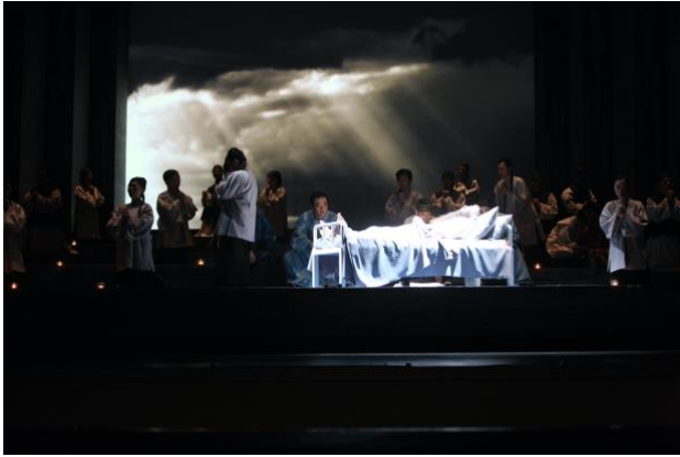
Mackey: The Black-bearded Bibleman (2008) Opera Production of National Performing Arts Center in Taiwan As Associate Producer