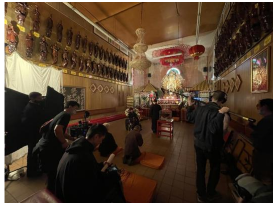
Rooster Will Crow Again (2022) Short Film Actor