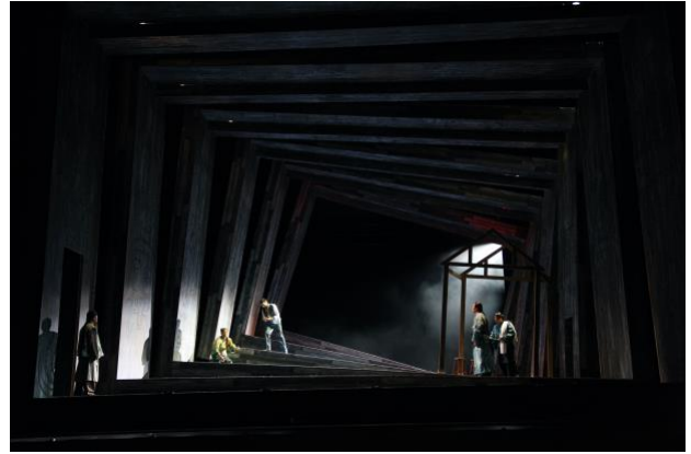
Mackey: The Black-bearded Bibleman (2008) Opera Production of National Performing Arts Center in Taiwan As Associate Producer