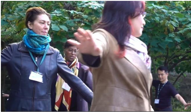
Cultural Workshop: Peking Opera (2021) Inwood Arts Work As Facilitator