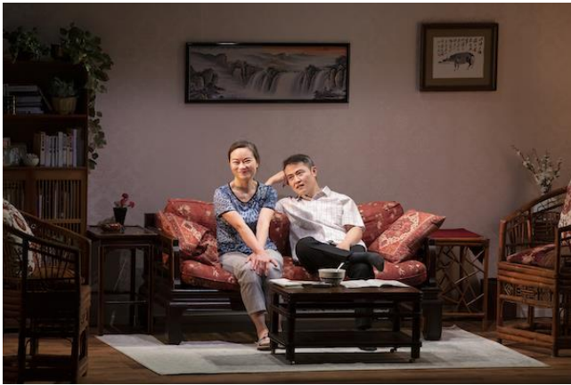
Golden Shield (2022) Manhattan Theatre Club As Actor